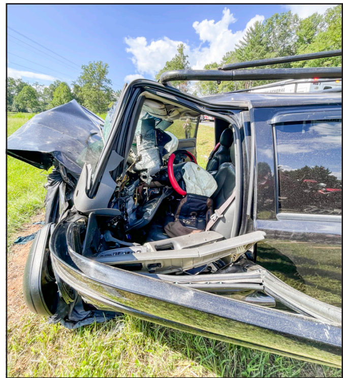
Both vehicles were disabled in the Aug. 19 crash on Georgia 325.

"Be prepared to take evasive action," he continued, "because you just might end up with somebody in your lane on the wrong side of the road."