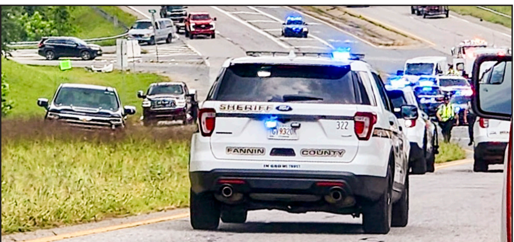
Area residents took to Facebook this month to discuss the need for a red light at Loving Road and Georgia 515 in Fannin County, where a fatal wreck involving a Blairsville man took place Aug. 16.